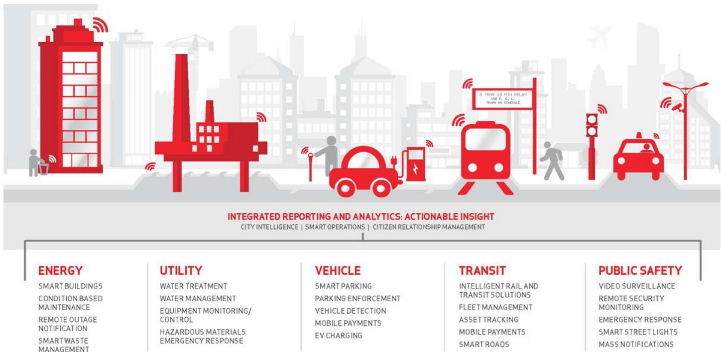
Figure 1: Sample Smart City Features

According to a recent report issued by Persistence Market Research, the global Smart Cities market is forecast to leap from $622 billion in 2016 to more than $1 trillion in 2019 and $3.5 trillion in 2026. Smart City projects are urban development efforts to integrate new IT and communications technology resulting in a more efficient management and provision of city assets/services through the use of raw data and predictive analysis. The deployment of sensors and other information and communication technology infrastructure across a municipal network fosters improvement in safety, efficiency, economics, and quality of life for residents.