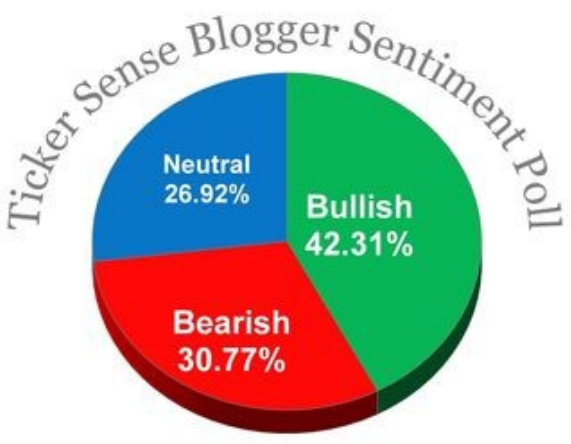
July 13 - 17, 2015

Well, we thought that there would not be much movement from one week to the next in the TickerSense Poll. We could not be more wrong! It just goes to show you how quickly things change on a dime, including investor pro sentiment. We knew we were reaching