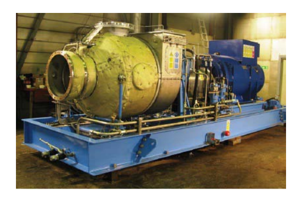
Image II. Ener-Core Powerstation KG2-3G/GO

Management projects that the Company's second commercial product will be the Ener-Core Powerstation KG2-3G/GO, which combines the Gradual Oxidizer technology with a two megawatt gas turbine, developed by Dresser-Rand and is part of a joint development project with Dresser-Rand. Ener-Core has completed system layout and analytic models integrating the Gradual Oxidizer with this turbine and has initiated design and development of the KG2-3G/GO. Field test units should be deployed sometime in late in 2014 or 2015 with initial commercial shipments to occur shortly thereafter.