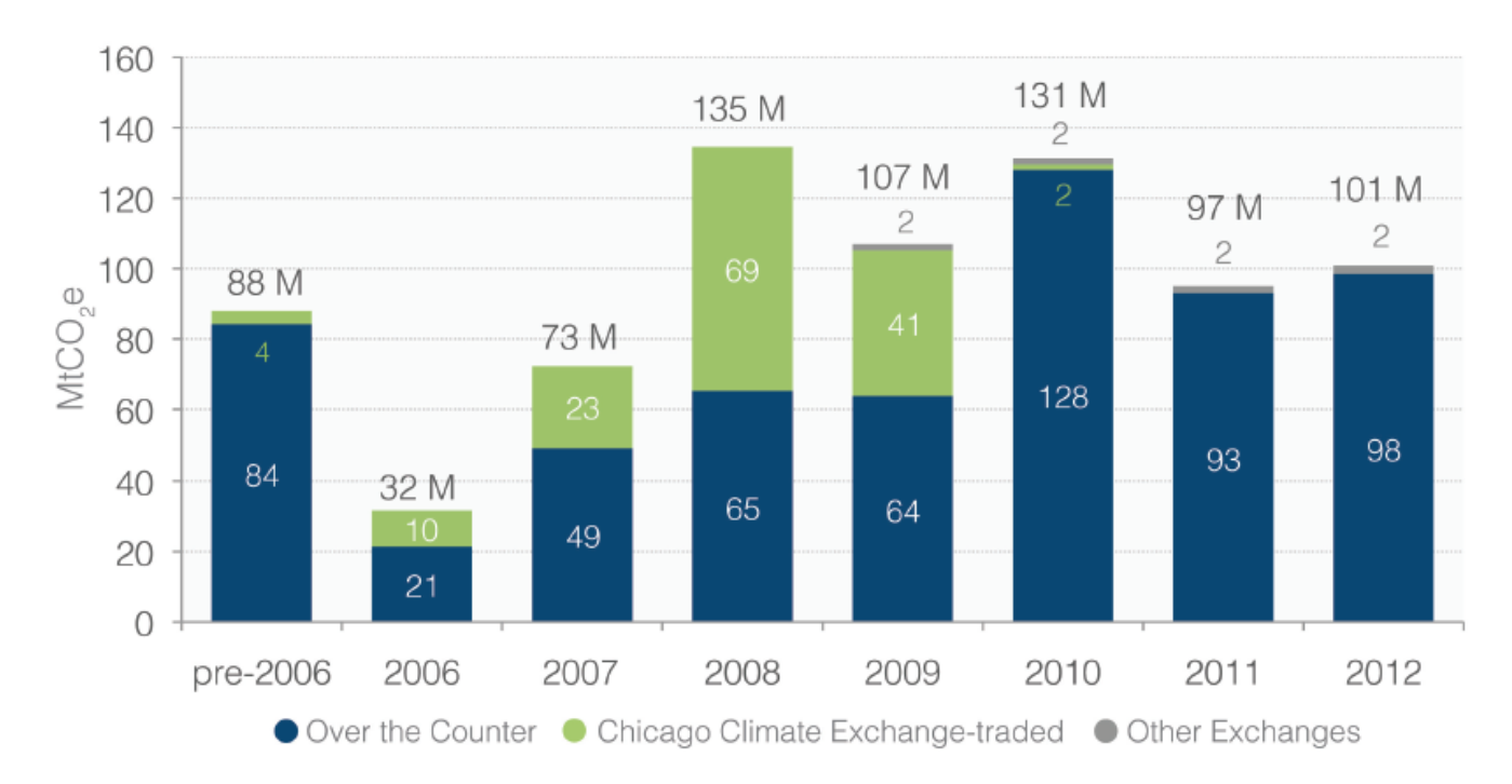
Figure 2: Historical Transaction Volume, Voluntary Markets

Figure 2 shows the historical transaction and volume of the voluntary CER market in terms of metric tons of CO<sub>2</sub> emissions (Mt CO<sub>2</sub>e). It can be easily seen that the trend to OTC trading is dominating the market.