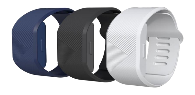
Figure 2: SOBRsure

The patent-pending alcohol detection platform and its products solution help prevent an intoxicated worker from taking the factory floor or a driver from receiving the keys to a truck, bus or rideshare vehicle. An offender is immediately flagged, and an administrator is empowered to take the appropriate corrective actions. Workplace intoxication and other alcohol abuse remain a core issue across the country. The annual cost of alcohol abuse in the U.S. is estimated to be $249 billion, according to SOBRsafe. Nearly half of all industrial accidents with injuries are alcohol-related, and 1-in-10 U.S. commercial drivers test positive for alcohol (the highest rate worldwide). Today, the primary firms in this space are breathalyzer firms. These include SCRAM, BACTRACK, BI TAD, Soberlink, Smart Start, Intoxalock and others primarily focused on the judicially mandated market, i.e., breathalyzers for breath alcohol content (BrAC) measurement, or court-ordered ankle monitors.