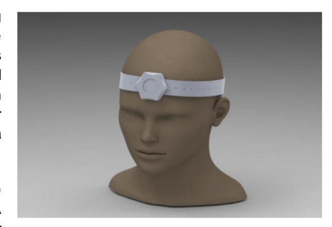
Auracis™ Artist Rendition

Transcutaneous electrical nerve stimulation (TENS) therapy uses low voltage electric impulses to relieve pain. A primary effect of TENS therapy may include "blockade" or "scrambling" of pain signals to the brain. Another