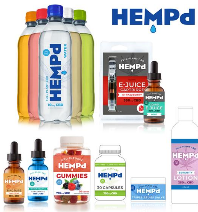
Figure 5: HEMPd Product Line

released HEMPd website and through other major distribution channels, such as Amazon . Our primary focus will be on selling directly to consumers, which will give more efficient delivery options, higher margins, and allows marketing HEMPd to the entire U.S. RMHB also plans to launch HEMPd CBD-infused waters at targeted retailers in Southern California in the April/May time frame, followed by other retailers in the summer.