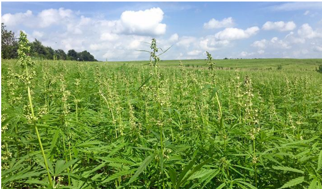
Figure 2: Sample Hemp Field

Some states liberally permit the growth and cultivation of industrial hemp – for any legally permissible purpose. Many of these states' statutes recognize industrial hemp as a marketable, agricultural commodity. Most states distinguish industrial hemp (generally defined as any non-psychoactive part of the cannabis plant) from marijuana, oftentimes a controlled substance.