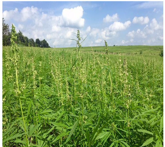
Figure 1: Sample Hemp Field

To appreciate the development of laws permitting growth and cultivation of industrial hemp is, in part, to understand the difference between hemp and marijuana. There is a common, and unfortunate, misconception surrounding industrial hemp; the hemp crop is often confused with its cousin marijuana. While both hemp and marijuana derive from the plant genus cannabis , unlike marijuana, hemp cannot produce a psychoactive effect. Hemp contains trace levels of THC, a cannabinoid with the capability of producing a psychoactive high. Marijuana, on the other hand, is used – medically and otherwise – precisely because of its THC content.