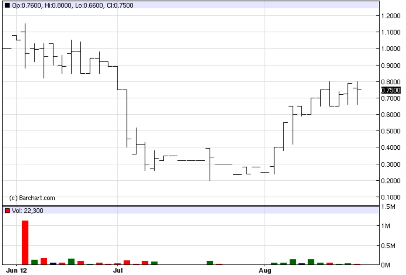
LBGO - Liberty Gold - Daily OHLC Chart