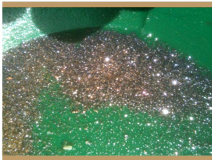
Image I. Visible Gold Sampling Results

Arizona has a rich tradition in gold production going back hundreds of years and it remains a very fertile opportunity for mining companies. In addition to Liberty Gold, industry giants BHP Billiton (NYSE – BHP), Rio Tinto (NYSE – RIO), and Newmont Mining (NYSE – NEM) all have ongoing operations in the area. Liberty Gold's 794-acre Domestic Portfolio mining operations claim block is located in perhaps the most mineralized area of Arizona. Situated in the Cerbat Mountain range on Stockton Hill, the holdings are roughly 75 miles southeast of Las Vegas and 15 miles northwest of Kingman in northwestern Arizona's Wallapai Mining District in Mojave County. The Company has a 100% interest in the Domestic Portfolio, which consists of 40 individual projects ranging in size from 16 to 20 acres each: 4 patented mining claims, 11 Federal mining claims (unpatented), and 25 pure exploration prospects.