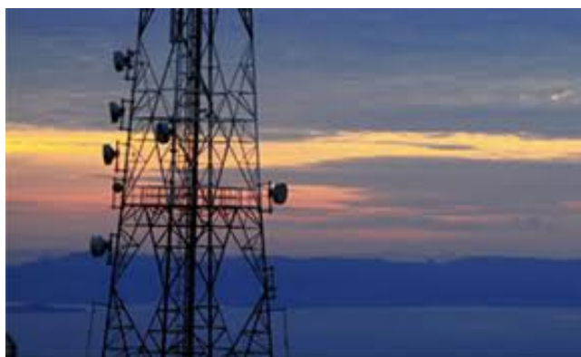
Image I. Microwave Towers

With two distinctive areas of expertise – RF and Microwave Engineering, centered on Converged Networks – 3G (UMTS), 4G (LTE), for Cellular, Land Mobile Radio Communications (Two-Way Radio Communications), Broadband (WiFi), and Digital Healthcare industries, TeleFix is poised to deliver high quality and effective services in Design, Project Management, Network Planning, Installation, and Deployment.